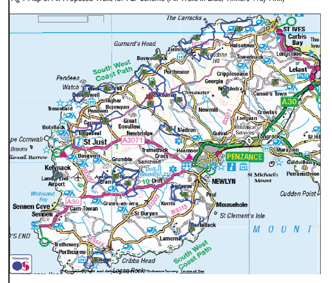
Fig I Map of All Proposed Trails for PLP Scheme (All Trails in Blue; Tinners Way Pink)

Detailed Maps of Individual Trails can be accessed at : <a href="http://www.parow.org.uk/mapping/PLP/Ridingmap.php?id=Access&map=walksindex">http://www.parow.org.uk/mapping/PLP/Ridingmap.php?id=Access&map=walksindex</a>